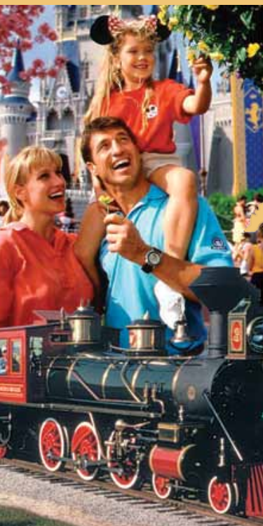
Photo ID required; valid Theme Park ticket required (except for Disney's Wilderness Back Trail Adventure and Disney's Yuletide Fantasy).

Backpacks or other packages are not allowed. All programs are subject to change. For times, dates, availability, and additional information, please call (407) WDW-TOUR (407-939-8687). An accepted major credit card guarantee is required. Cancellations must be made at least 48 hours in advance or a cancellation charge may be incurred.