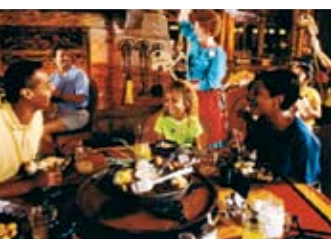
Table Service Meals

Look for this symbol to identify Quick Service restaurants, outdoor food carts and select merchandise locations that accept your Disney Dining Plan and to identify eligible snack options. You may redeem your snacks at most Quick Service restaurants, outdoor food carts and merchandise locations selling frozen ice-cream novelties, popcorn or Coca-Cola® products throughout the Walt Disney World® Resort.