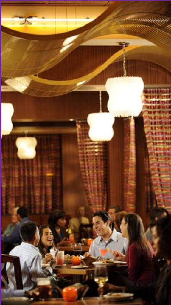
The Wave at Disney's Contemporary Resort