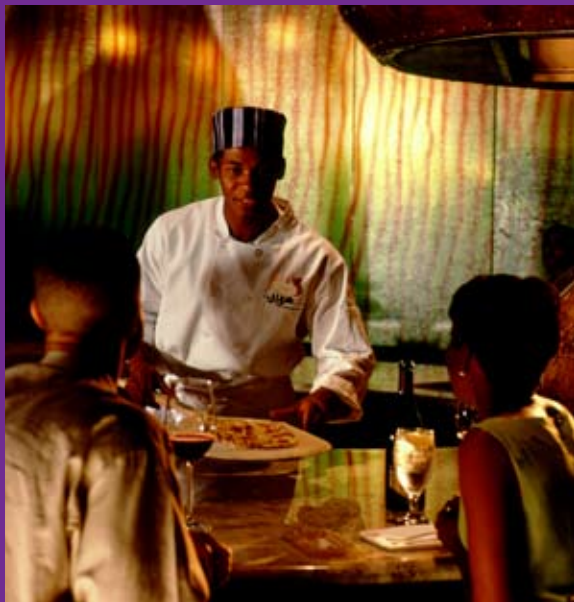
Jiko - The Cooking Place at Disney's Animal Kingdom Lodge A Disney Signature Restaurant